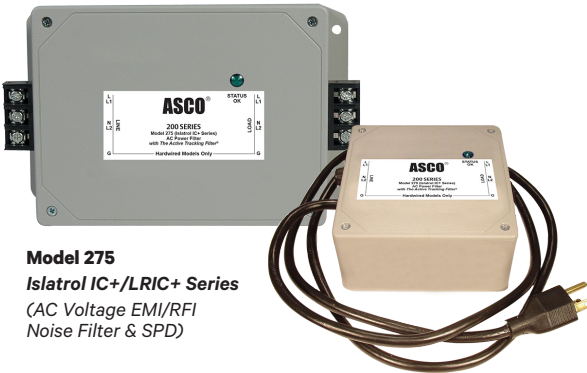
Model 275 Isolatrol IC+/LRIC+ Series (AC Voltage EMI/RFI Noise Filter & SPD)