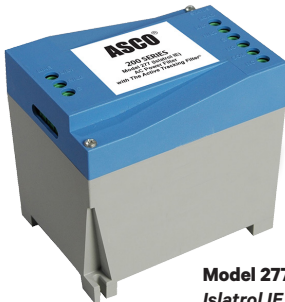
Model 277 Isolatrol IE Series (AC Voltage EMI/RFI Noise Filter & SPD)