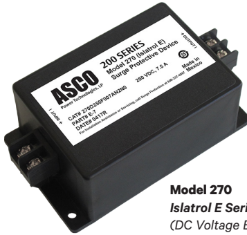
Model 270 Isolatrol E Series - DC (DC Voltage EMI/RFI Noise Filter & SPD)